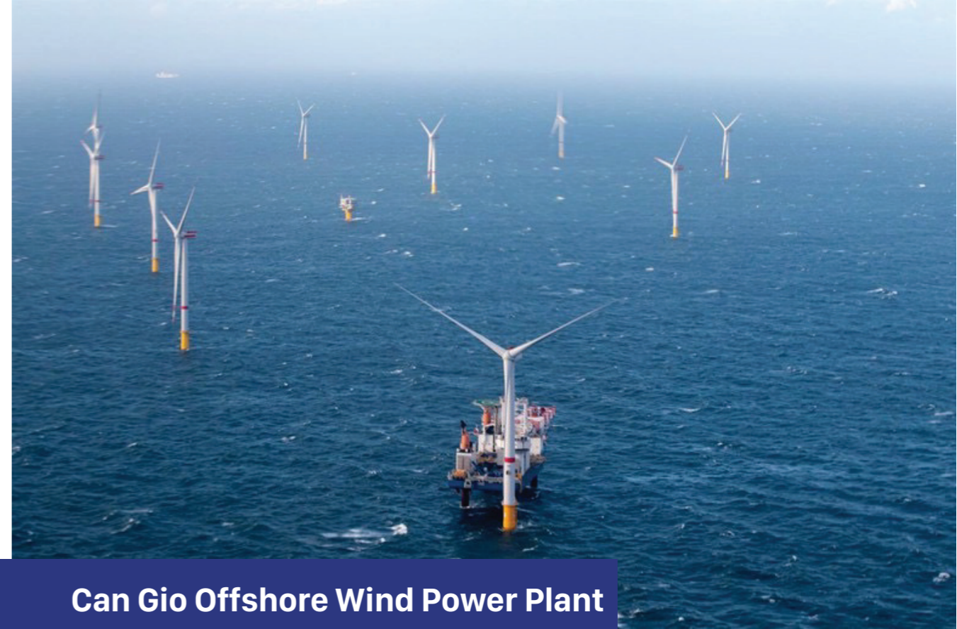
11 Can Gio Offshore Wind Power Plant Location: Can Gio District, Ho Chi Minh City Capacity: 1000 MW Currently proposed for investment.