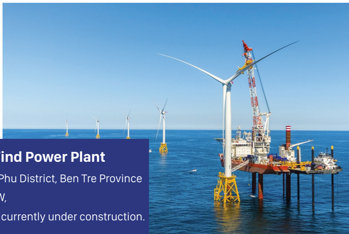
09 Hai Phong Wind Power Plant Location: Thanh Phu District, Ben Tre Province Capacity: 435 MW, Initiated in 2024, currently under construction.