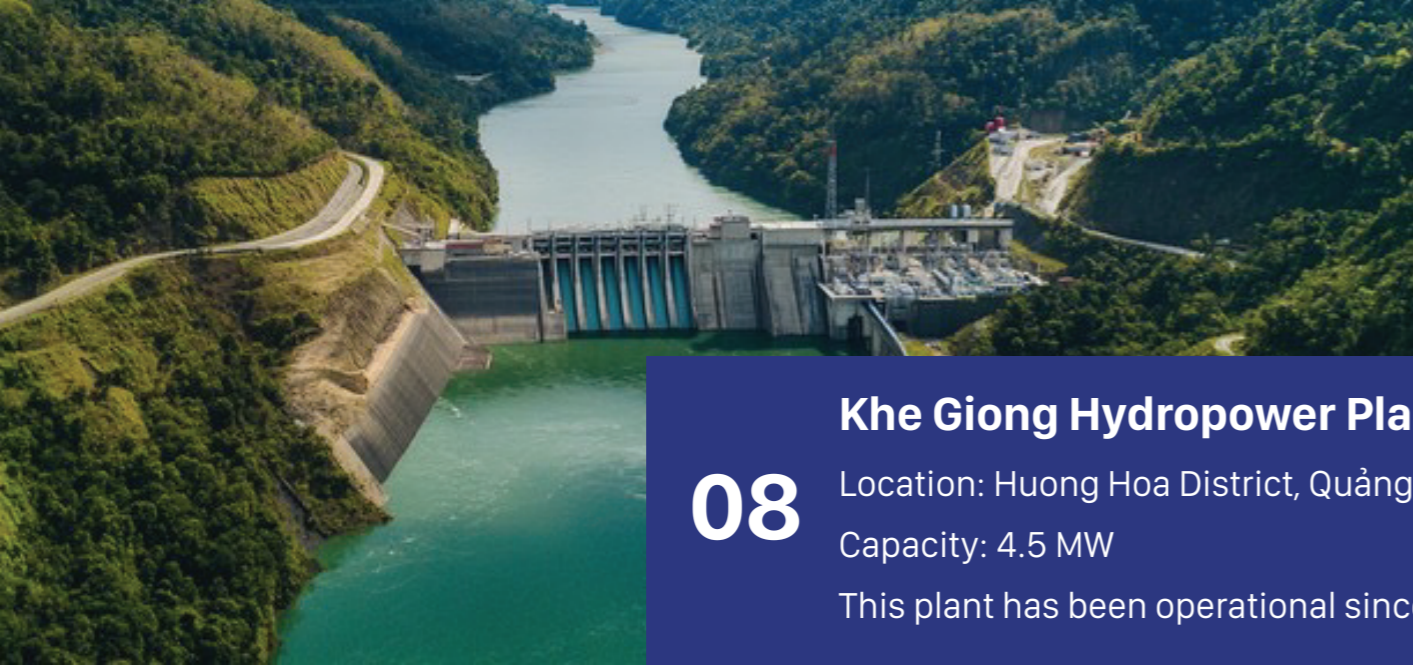
08 Khe Giong Hydropower Plant Location: Huong Hoa District, Quảng Tri Province Capacity: 4.5 MW This plant has been operational since 2016.