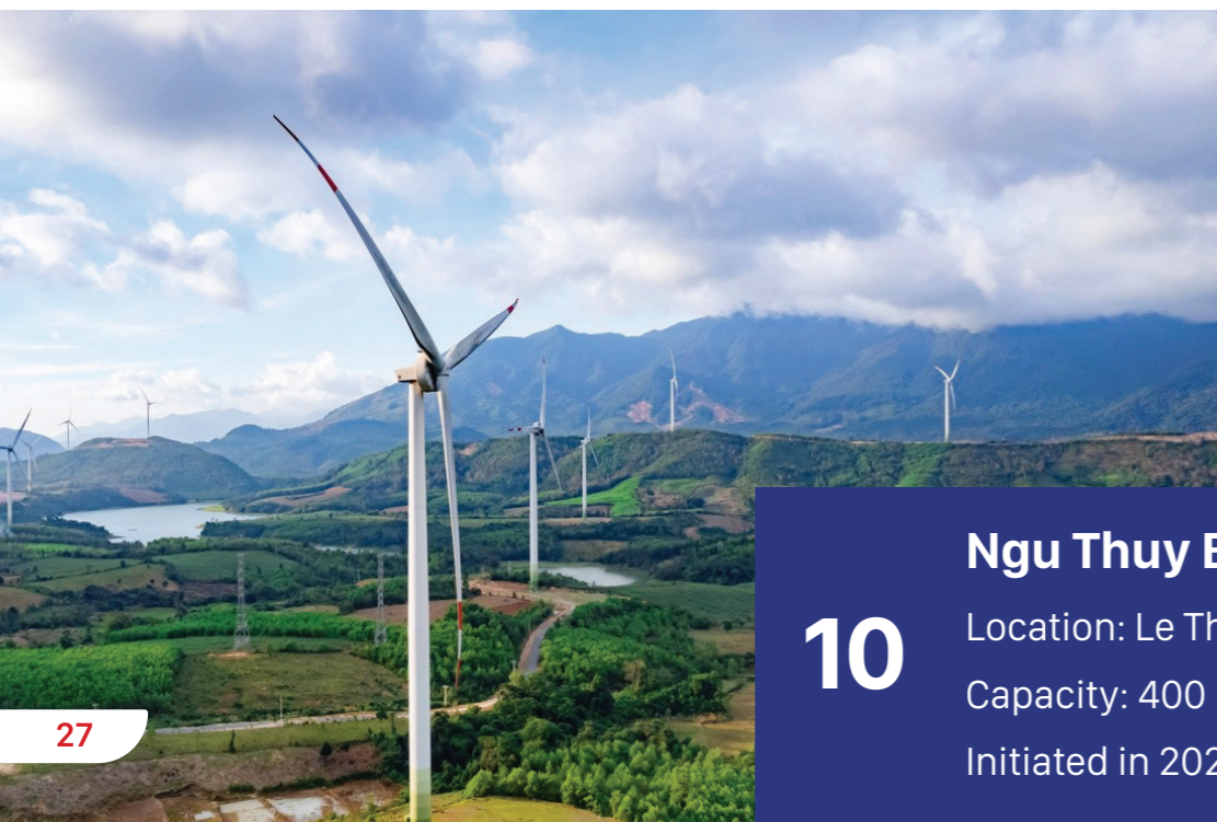
10 Ngu Thuy Bac Wind Power Plant Location: Le Thuy District, Quang Binh Province Capacity: 400 MW, Initiated in 2025.